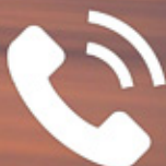
TIVADAR PUSKÁS TELEPHONE EXCHANGE