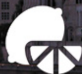
ALBERT SZENT-GYÖRGYI DISCOVERED VITAMIN C