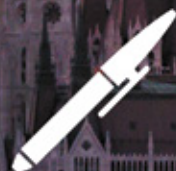
LÁSZLÓ BÍRÓ BALLPOINT PEN