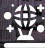
DENNIS GABOR HOLOGRAPHY