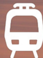
KÁLMÁN KANDÓ ELECTRIC RAILWAY TRACTION