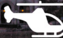
OSZKÁR ASBÓTH HELICOPTER